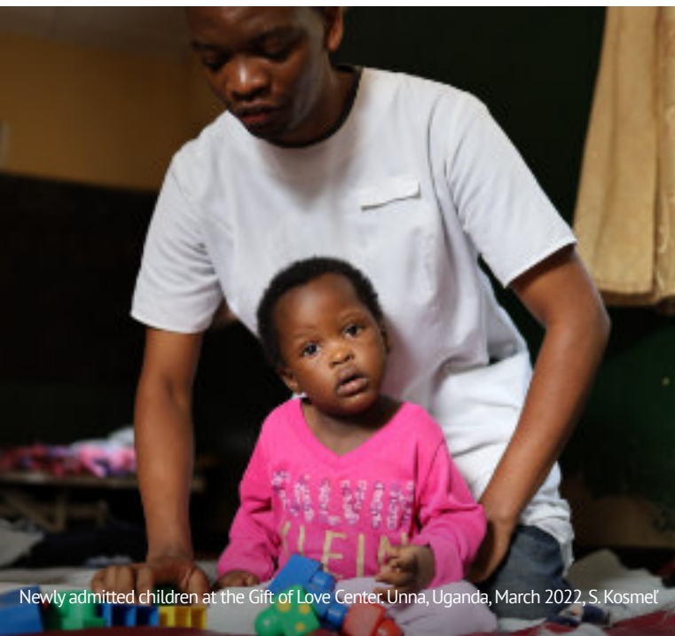
Newly admitted children at the Gift of Love Center, Unna, Uganda, March 2022, S. Kosmel

Our priorities were the education of children and young people from a socially deprived environment and targeted support for poor families from Sub-Saharan Africa. We started to support the treatment of medically disadvantaged children in Rwanda. We are glad that 8 volunteers from Slovakia took part in it and 23 participants travelled to the first charity pilgrimage to Rwanda.